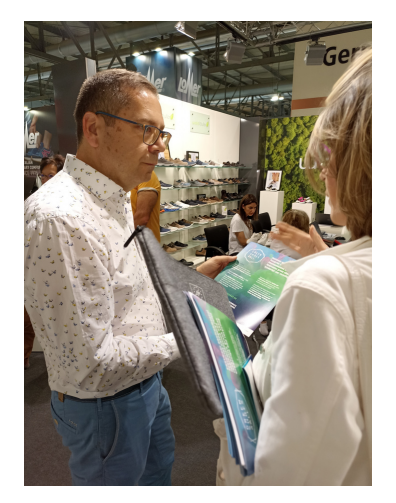
Engaging with companies at MICAM. September 2022

As you already know, the main project outcomes include: